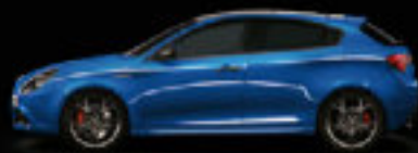
756 - Milano Blue*