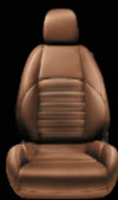
Sports Leather Tan