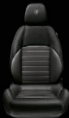
Competizione Cloth Upholstery Black