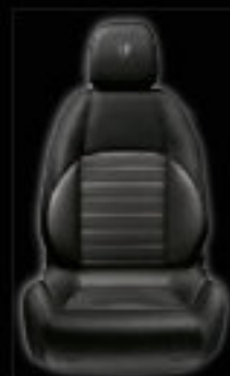
123 - Black