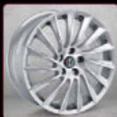
68Q-18" Turbine design alloy wheels with 225/40 R18 tyres