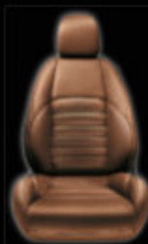
465 - Tan