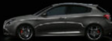
409 - Lipari Grey