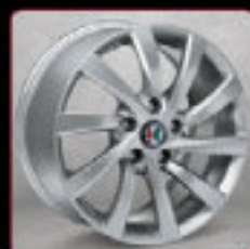
431-16" Turbine design alloy wheels with 205/55 R16 tyres