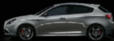
318 - Stromboli Grey