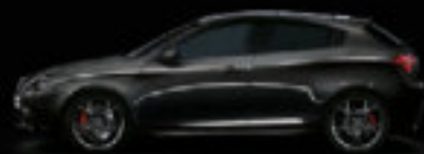
601 - Alfa Black