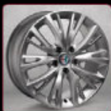
74B-17" Multi spoke alloy wheels with 225/40 R18 tyres