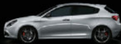
620 - Silverstone Grey