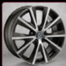
6H6-18" Dual 5 spoke alloy wheels with titanium finish with 225/40 R18 tyres