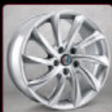
420-17" Turbine design alloy wheels with 225/45 R17 tyres