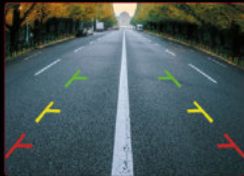
Tech Pack - Rear View Camera