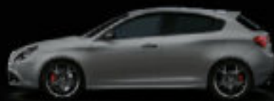
529 - Matte Magnesio Grey**