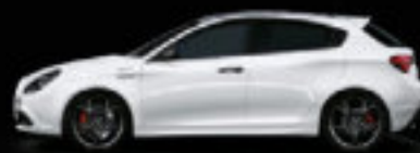
217 - Alfa White