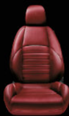
Sports Leather Red