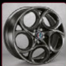
6Y8-17" 5 hole design alloy wheels with dark finish with 225/45 R17 tyres