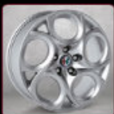
5YN-17" 5 hole design alloy wheels with 225/45 R17 tyres