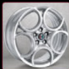
68P-18" 5 hole design alloy wheels with 225/40 R18 tyres