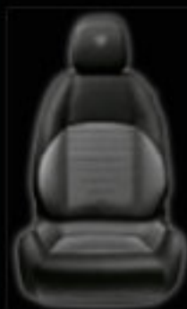
198 - Black - Antracite*