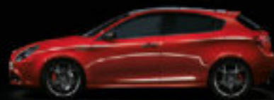
361 - Competizione Red*