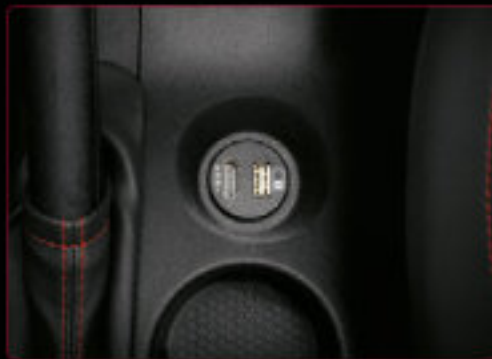
Tech Pack - HDMI Port