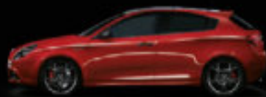
414 - Alfa Red