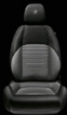
Giulietta Cloth Upholstery Black/Antracite

VDC (ABS + ASR + EBD + Brake Assistant) with Hill Holder