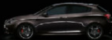
805 - Etna Black