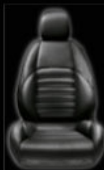
402/408 - Black