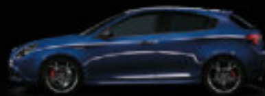
486 - Cobalto Blue