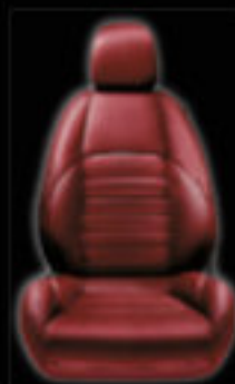
401 - Red