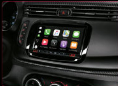
Tech Pack - Alpine 7" Touchscreen with Apple CarPlay and Android Auto™