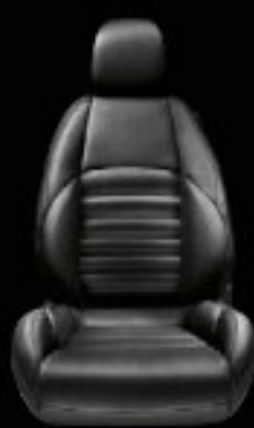
Sports Leather Black