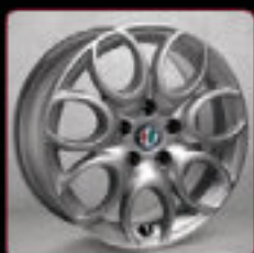
74A-16" 7 hole design alloy wheels with 205/55 R16 tyres