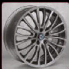
6C7-18" Burnished Multi-spoke alloy wheels with 225/40 R18 tyres