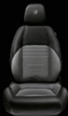
Giulietta Cloth Upholstery Black/Antracite