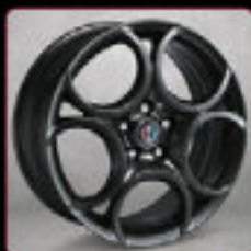
6C6-18" 5 hole design alloy wheels with dark finish with 225/40 R18 tyres